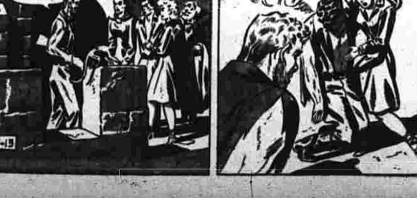
Dragor Leaves His Mark: 'Quick, carry him inside!' 'Oh, Johnny, he's...'