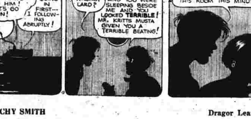
A Handsome Bedfellow