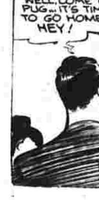
BOOTS AND HER BUDDIES