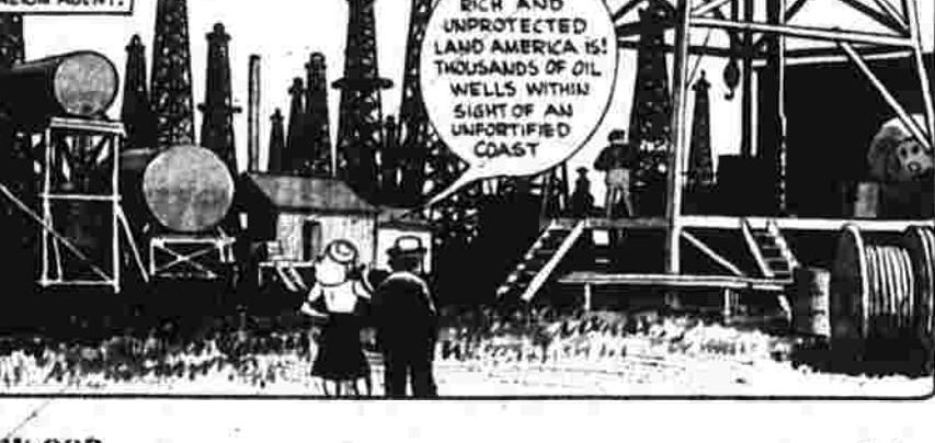
How Heiga Works