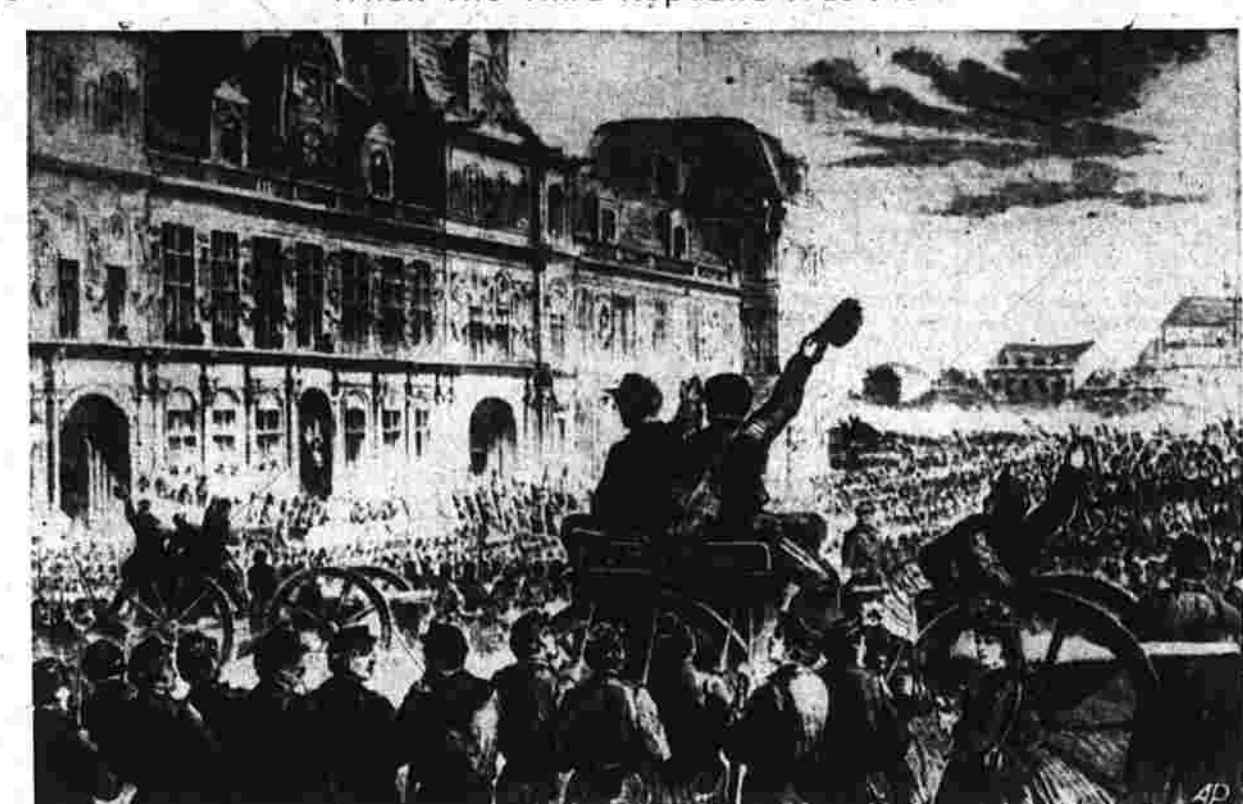
The third republic was established in February, 1871. A few weeks later it was disrupted by the Prussian war...